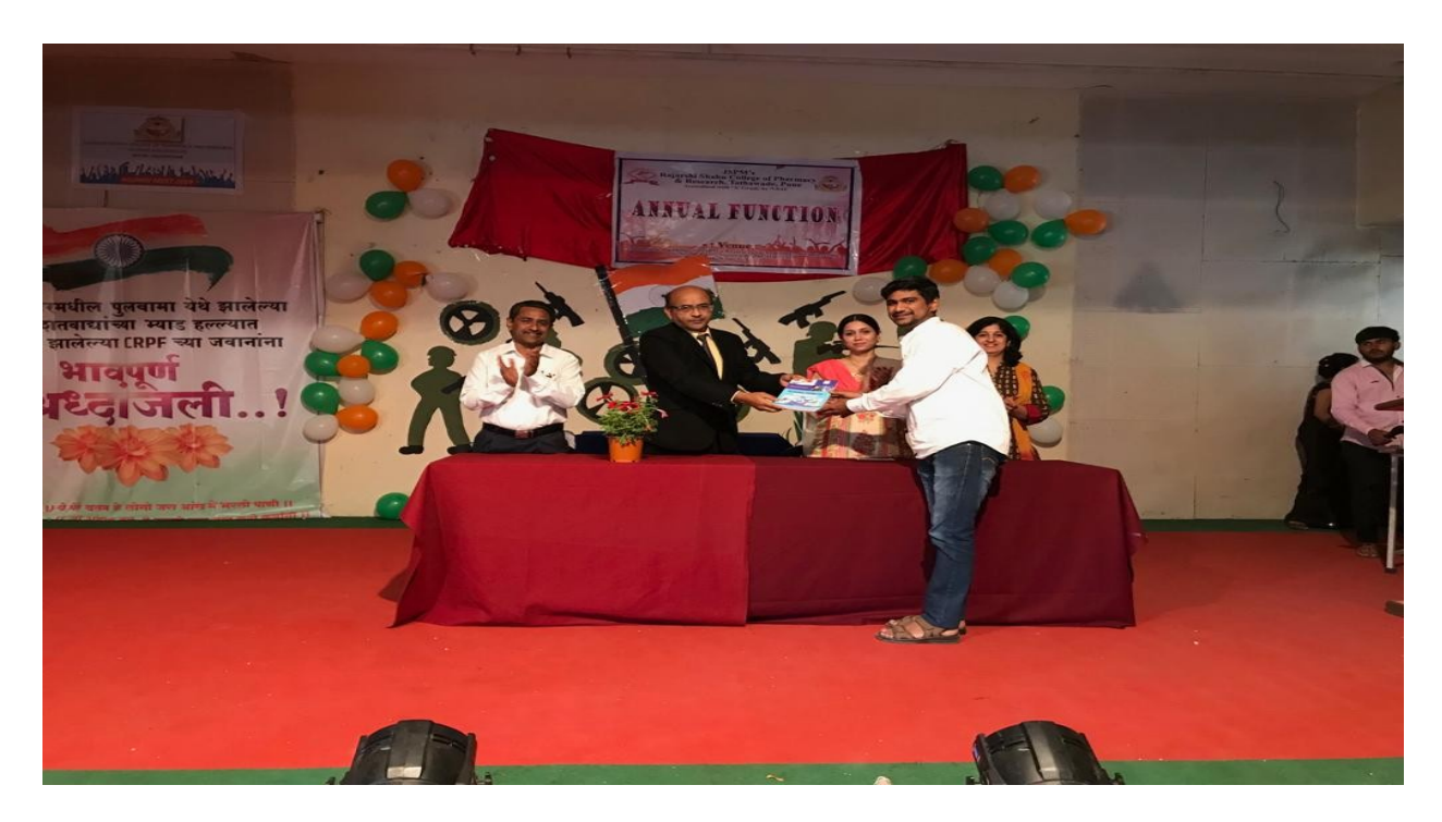
Our Alumni Alumni donated the books to the college library