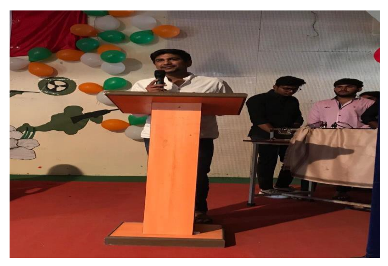
Our Alumni Alumni donated the books to the college library

Alumni Guided to the students regarding scope of pharmacy in industry